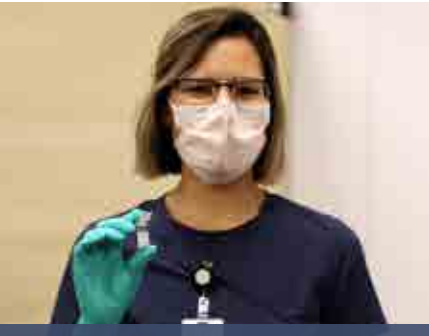
Southcentral Foundation received an initial allotment of the Pfizer vaccine.

With COVID-19 vaccinations becoming available, now is not the time to let your guard down. Continue to maintain physical distancing, wear