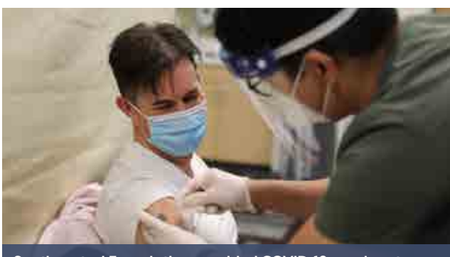
Southcentral Foundation provided COVID-19 vaccines to employees based on the established prioritization phase 1A list for critical health care personnel.

In what state health officials are calling a turning point in the pandemic, the first shipment of COVID-19 vaccines arrived in Alaska. Southcentral Foundation received an initial allotment of the Pfizer vaccine with the Moderna vaccine expected to arrive soon.