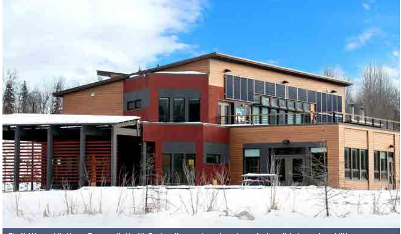
C'eyiits' Hwnax Life House Community Health Center offers services at no charge for beneficiaries and can bill insurance or charge on a sliding scale fee for non-beneficiaries.