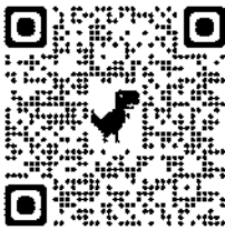
QR code for on-line form

Southcentral Foundation PCC II West - Expansion & Renovation (SCF22-1068)