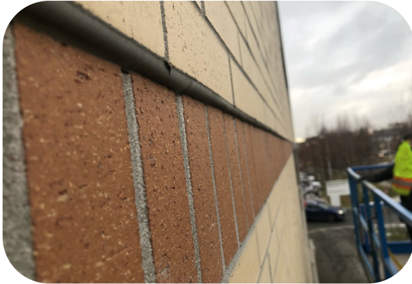
Caulking holding the brick in place.

Below are detailed photos of the damaged sheets on the North side.