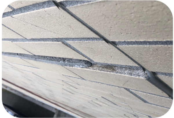
Grout lines cracking and brick sheets peeling away from wall.