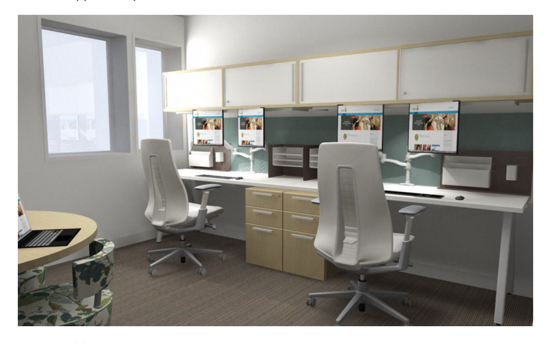
Figure 2, Exhibit A