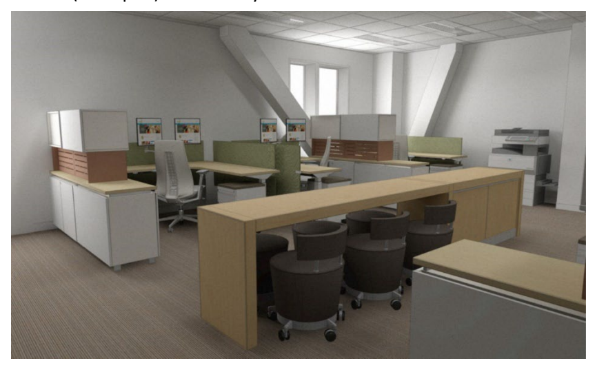
Figure 3, Exhibit A