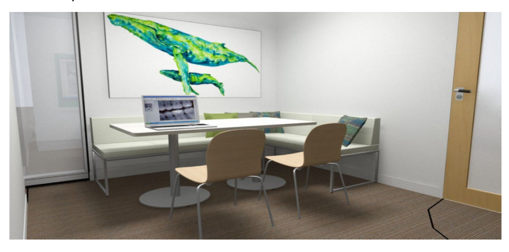
Figure 9, Exhibit A