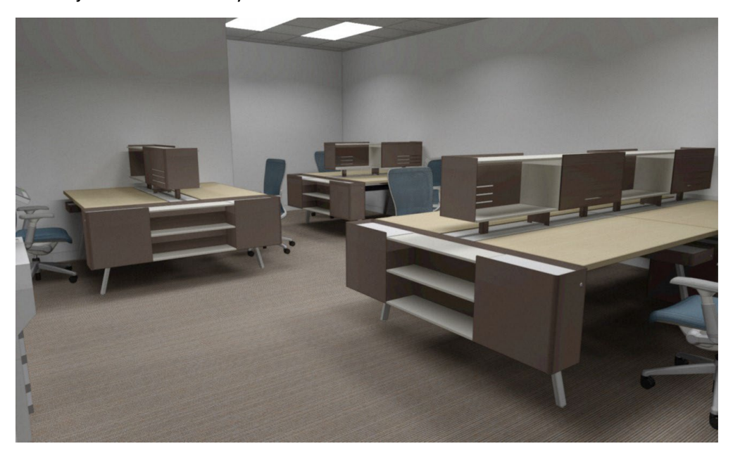
Figure 1, Exhibit A