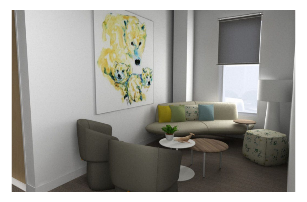
Figure 4, Exhibit A