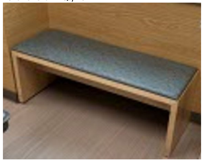
Figure 7, Exhibit A