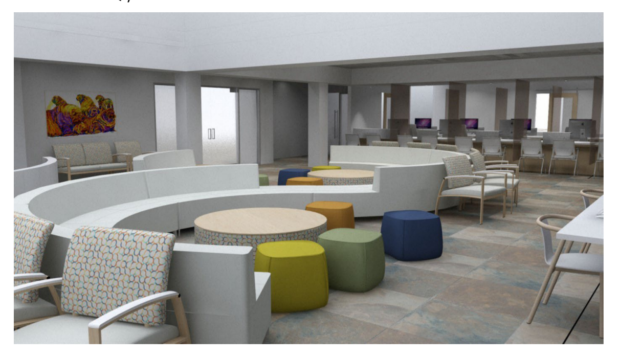
Figure 6, Exhibit A

Side Tables – Qty 5 Coffee Tables – Qty 3