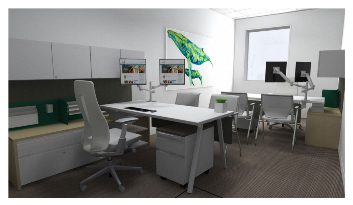
Figure 10, Exhibit A